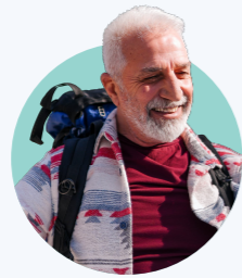
Government Integrity & Stability

Focused on the integrity of governance, these segments engage individuals committed to the transparency and stability of the electoral process. They target those interested in maintaining electoral integrity, ensuring fair elections, and supporting reliable governance practices.