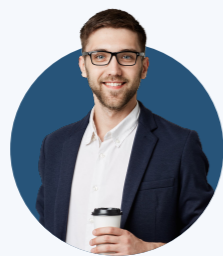
Foreign Policy & Global Affairs

Accommodating centrists and both left and right-leaning individuals, this segment targets advocates of personal freedoms and balanced viewpoints. It connects with those who champion liberty-focused perspectives, whether progressive or conservative.